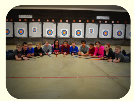
Previous Archery Class

All archery classes are six week programs that are taught every Thursday. Students learn about recurve, compound and crossbows. Instructors are certified