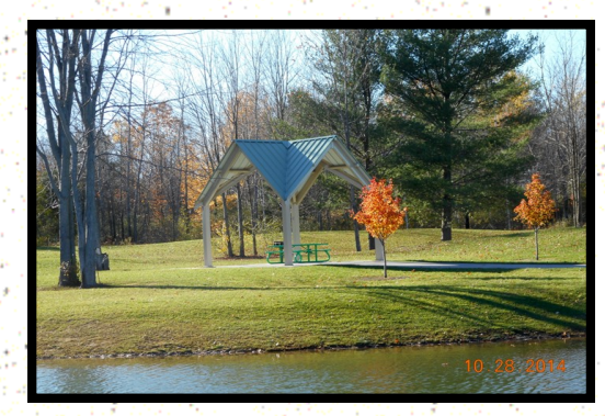
Roberts Park Pavilion funded by TTBA

~ Business/Education ~ Working Together ~ It Does Make a Difference