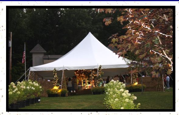
Evening in the Park